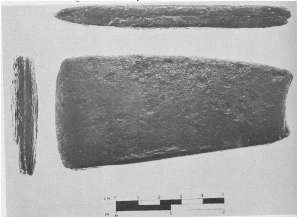
Figure 4 — Three views of the cleaned Sopher celt.