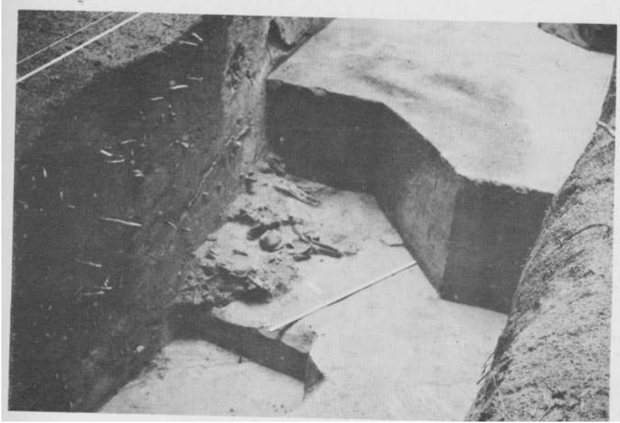
Figure 1 — South half of the excavated Sopher ossuary.