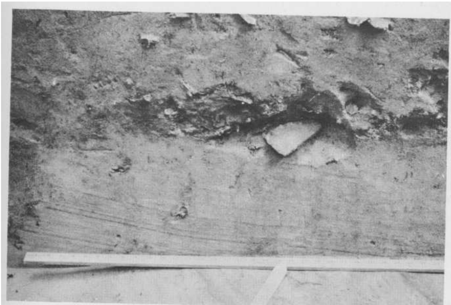
Figure 2 — The Sopher celt "in situ".