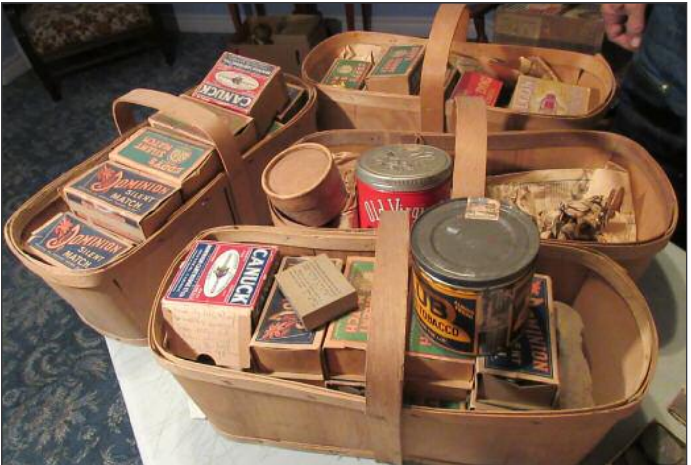
Figure 5: Twentieth Century Six Quart Basket Collection