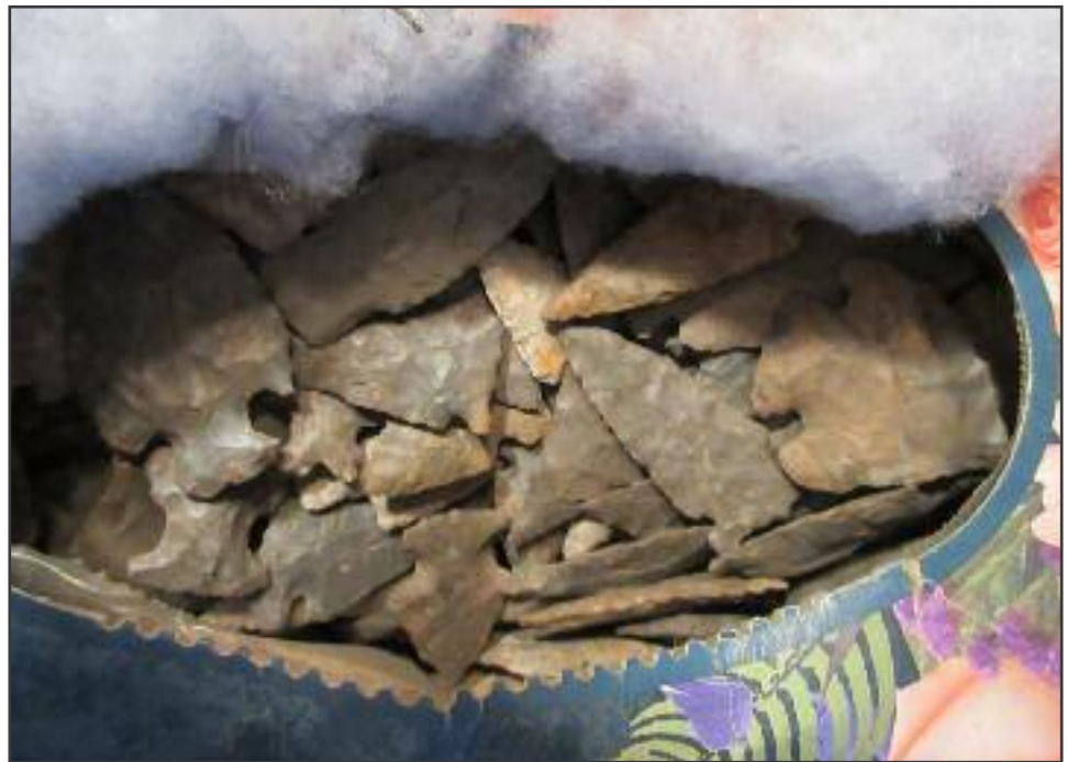
Figure 4: Tissue Box Contents

been attacked by silverfish, and the cardboard containers were beginning to deteriorate – imagine the impending massive loss of priceless information! Such immediate conservation concerns do not even speak to the ultimate fate of this collection, upon the