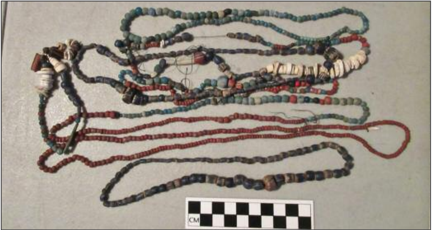
Figure 3: Strings of Early Seventeenth Century Beads

to local War of 1812 events (Figure 2). One match box had “Misener 1934” and another “Misener 1936” marked in pencil on them, containing what an annual surface collection of that c.1620-1640 Neutral village had produced – ceramic rims, lithic tools, European metal scraps. Who knew that these sites in the Brantford area (including Sealey and Purdy) had been collected so diligently for so long (Figure 3)! A careful inventory and analysis of these little annual collections would go far in providing a clearer characterization of these essentially stripped sites which have been collected and dug over for a century and more. There was an important collection of late Middle Woodland ceramic rims from the vicinity of the Yellow Point mound, reported by David Boyle in 1902. There were vast quantities of diagnostic lithics, both flaked chert and ground argillite (ie, bannerstones and gorgets) (Figure 4).