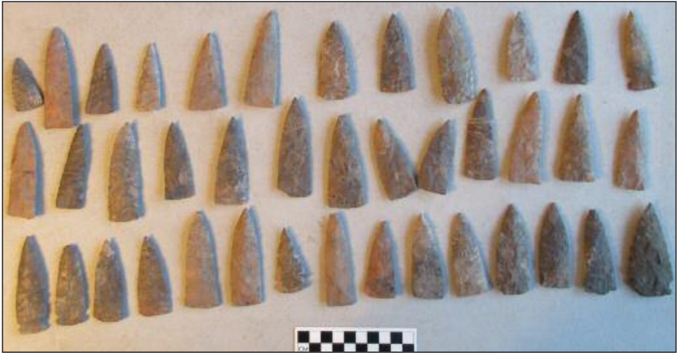
Figure 1: Meadowood Biface Cache on the Kitchen Table