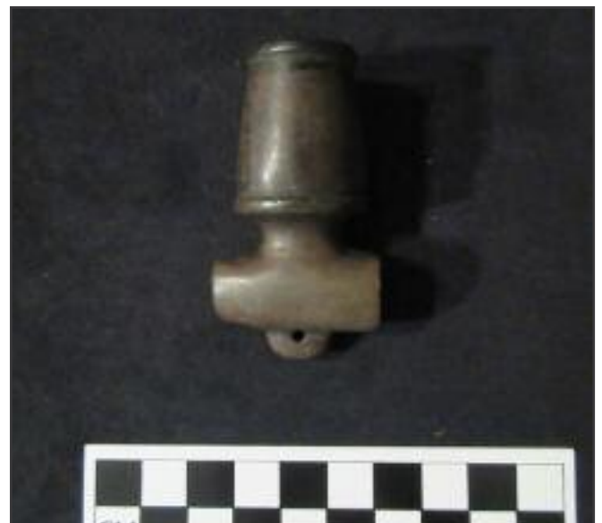
Figure 2: Nineteenth Century Stone Pipe

tained a pleasant surprise; another revelation concerning the Indigenous history of the region – especially, the chocolate boxes... I never knew what I would get! There was a collection of 40 superbly flaked Meadowood cache blades in one (Figure 1), but with no specific provenience. An iron (non-presentation) pipe tomahawk and a ‘Micmac’ style stone pipe probably related