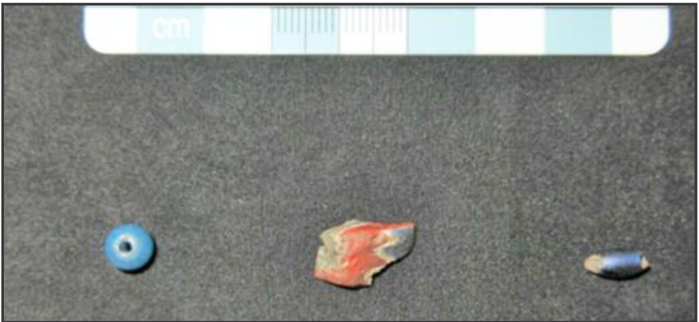
Figure 1. Glass Beads from the Trent-Foster Site (From Fox, 2017)

Bill himself notes (p. 11) that two of the beads are actually more likely to date to the early 17th rather than the late 16th century, in other words after the time when he states that the site was abandoned (although he suggests that perhaps they could have arrived before that). But there is documentary and archaeological evidence for the use of the general area in the