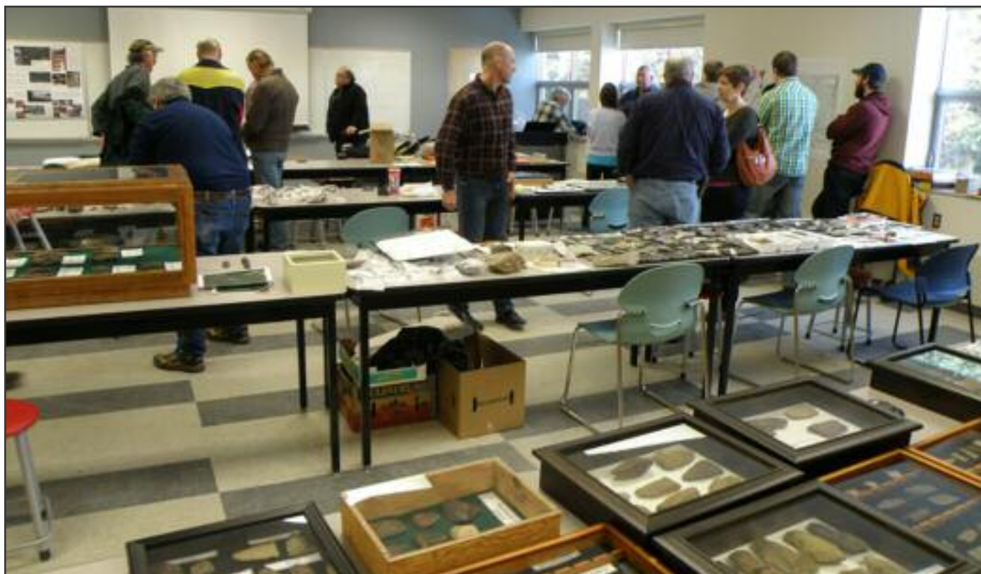
Thunder Bay Chapter co-hosted the Lake Superior Basin Workshop with the Department of Anthropology in March.

Greetings from the boreal forest, fellow Ontario archaeological enthusiasts! It has been awhile coming but the Thunder Bay chapter executive thought that it would be timely to share information about our activities. The chapter was formed in 1979 and has 25 current members, although our individual events often attract many non-members. Chapter members include professors, professionals from many fields, students, avocational enthusiasts, and the general public. We continue to partner with the Department of Anthropology at Lakehead University and the Lakehead University Anthropology Association student group on various