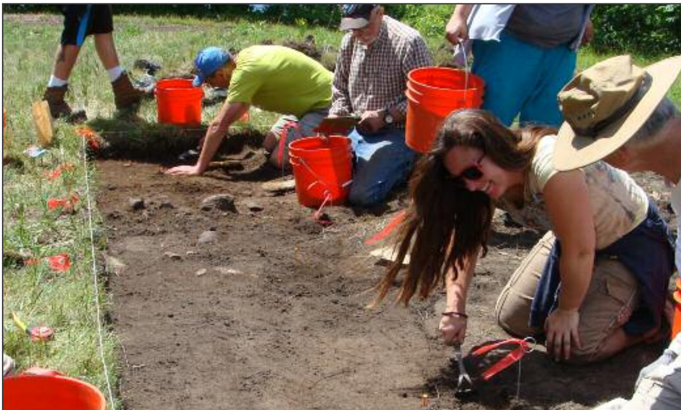
Members of the Peterborough chapter hard at work at a site on Jacob's Island, part of a Trent University / Curve Lake First Nation project.