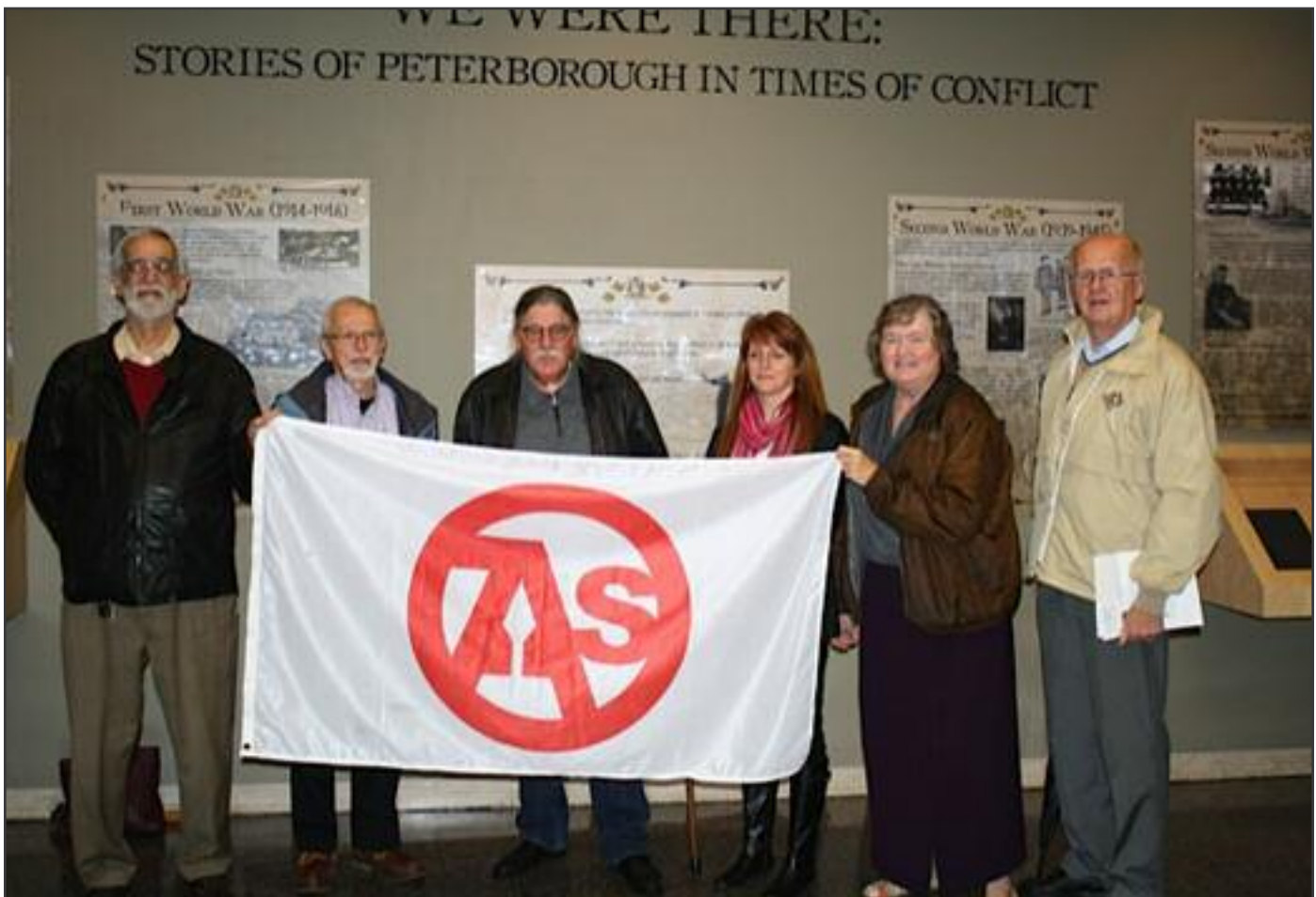
The Peterborough organizing committee shows off the new OAS flag.