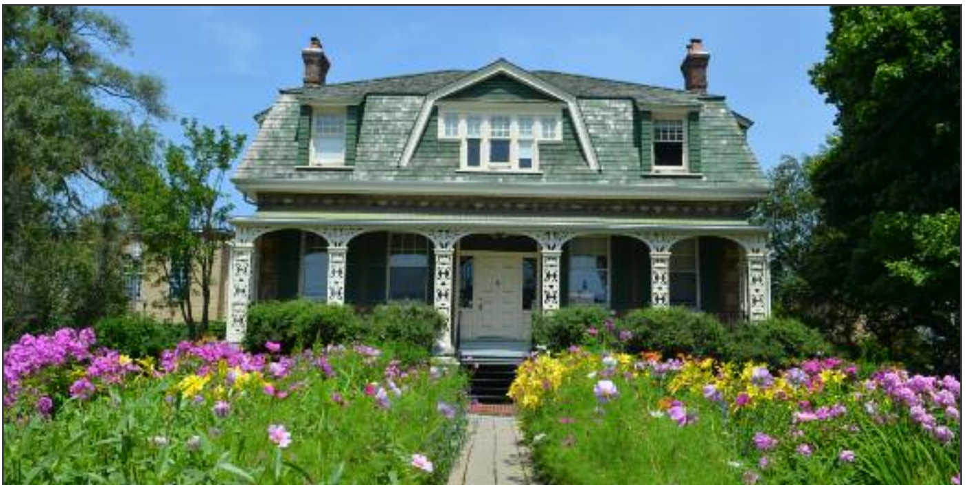
The beautiful Ashbridges House where the OAS has its office.