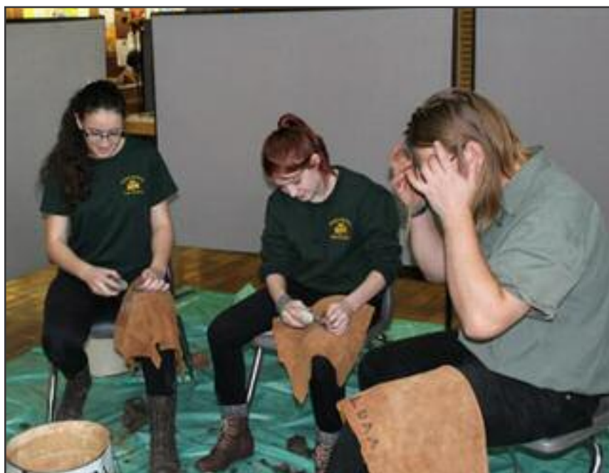
High School students learning about flintknapping.