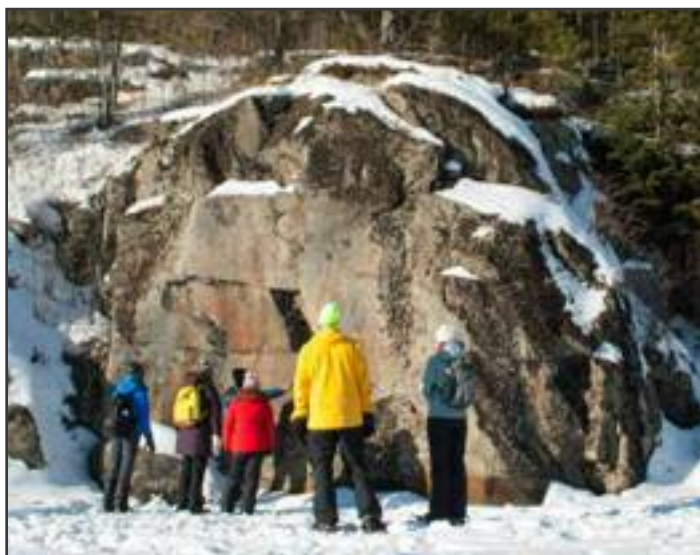
Students admiring the pictographs from Pictured Lake.