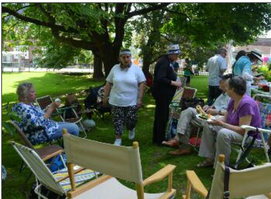
Toronto Chapter held its first ever summer BBQ this August under the shady trees on the Ashbridge Estate, where the OAS office is located.