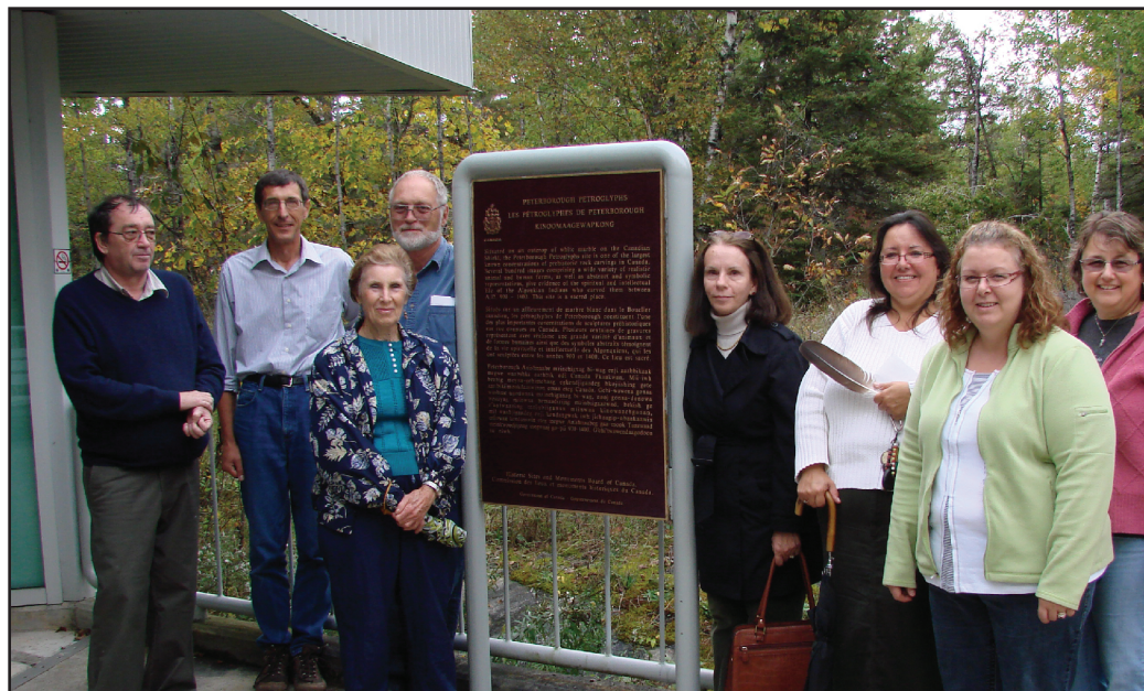
Peterborough Chapter visits the petroglyphs