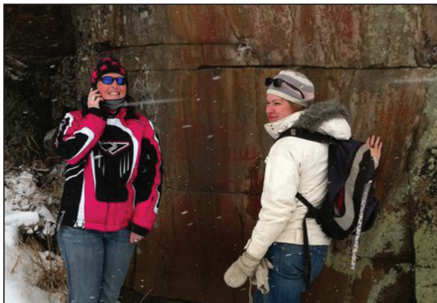
Thunder Bay Chapter visits the Pictured Lake pictographs

Activities sponsored by the chapter outside of meeting nights included a winter weekend at Limberlost Lodge in Haliburton, and a bus tour of Iroquoian village sites along the Humber River in Woodbridge. The winter weekend is an annual event attended by a small group (usually 10 -15) of chapter members who enjoy a variety of activities including skiing, snowshoeing, photography and reading by the fire. The bus tour was a great success with a packed bus of members who enjoyed narrated tours by local experts. Of course member events always include opportunities for food, drink and socializing – perhaps the activities we enjoy the most.