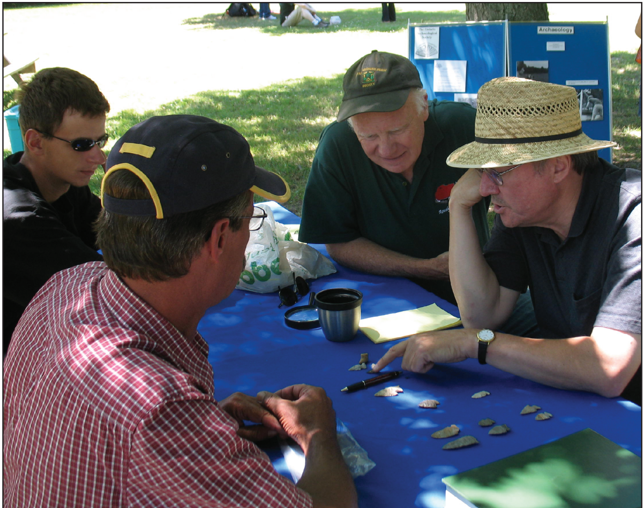
London Chapter's Archaeology Day at Longwoods